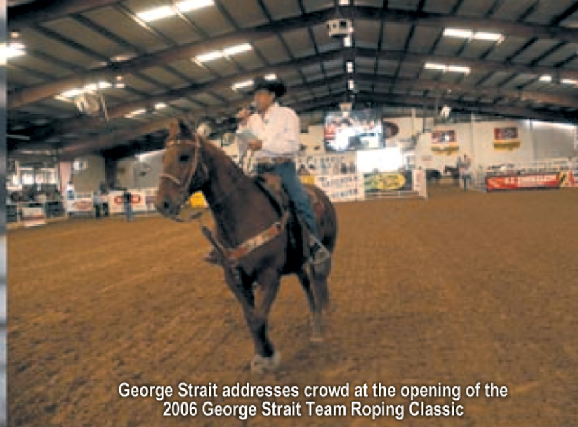
George Strait addresses crowd at the opening of the 2006 George Strait Team Roping Classic