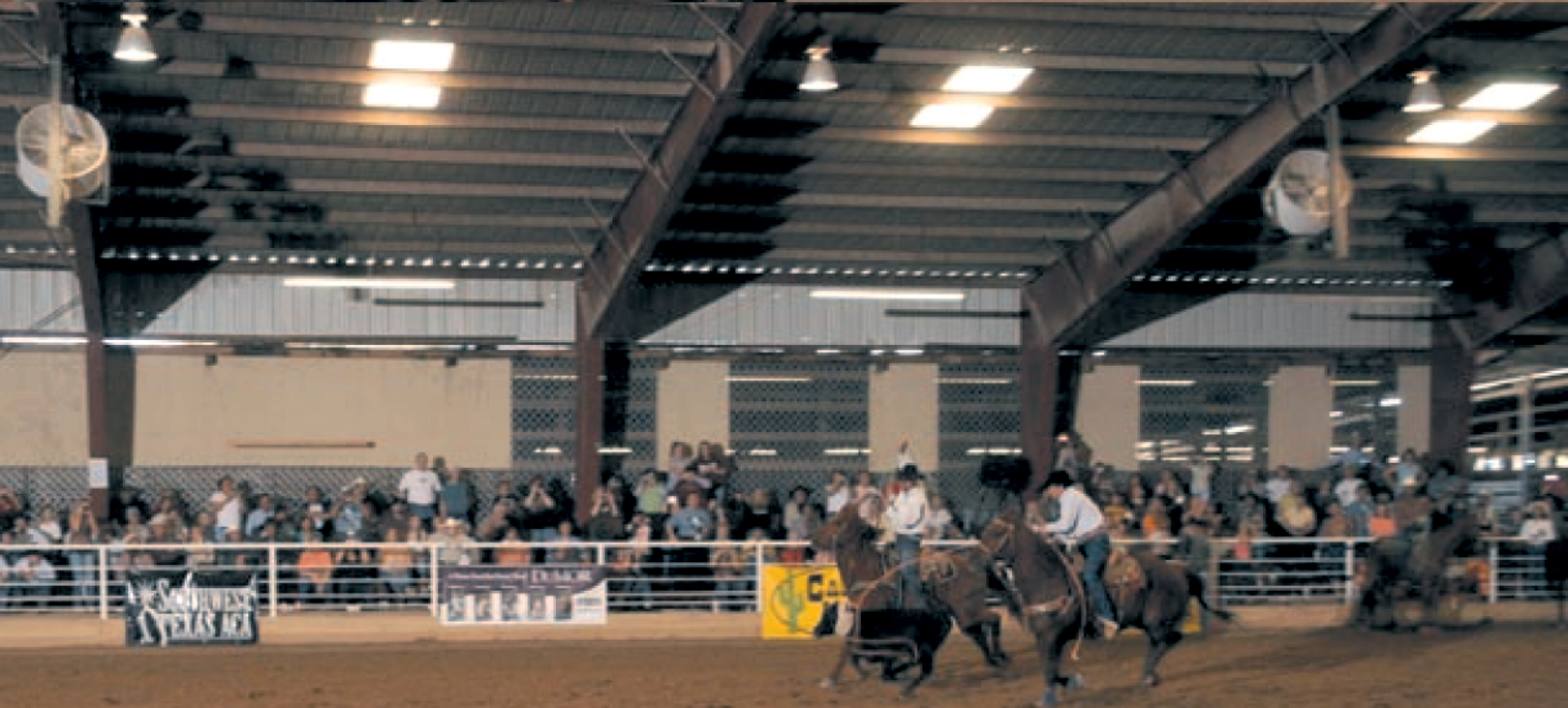
Action at the George Strait Team Roping Classic