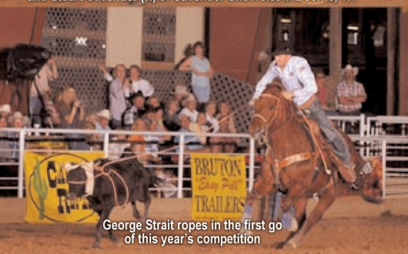
George Strait ropes in the first go of this year's competition