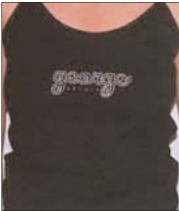
#4635 Black Spaghetti Tank