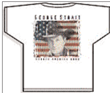
#5320 Youth Flag T-Shirt