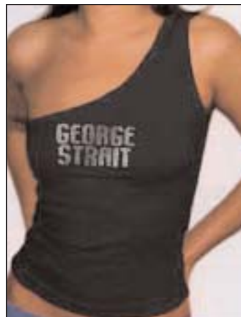
#4615 One Shoulder Top (Available in black or red)