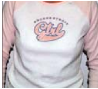
#4610 Ladies Baseball Jersey