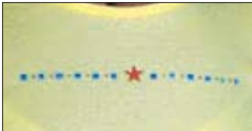
#4605 Long Sleeve Yellow