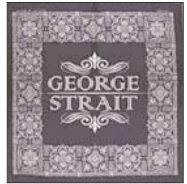
#4070 Navy Bandana