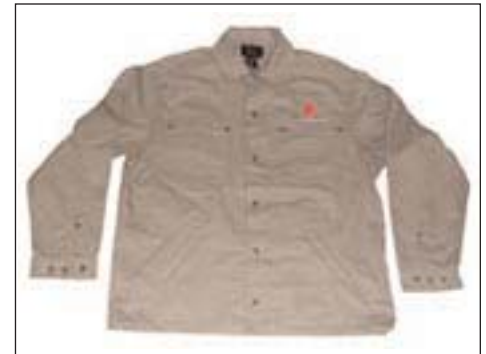
#9600 Natural Canvas Urban Coat