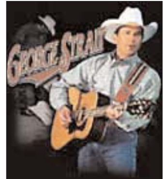
#5009 Black T-Shirt