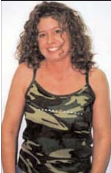
#4625 Camo Tank