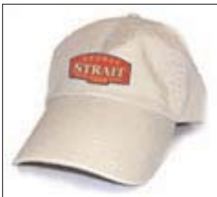
#4005 Embroidered Khaki Cap