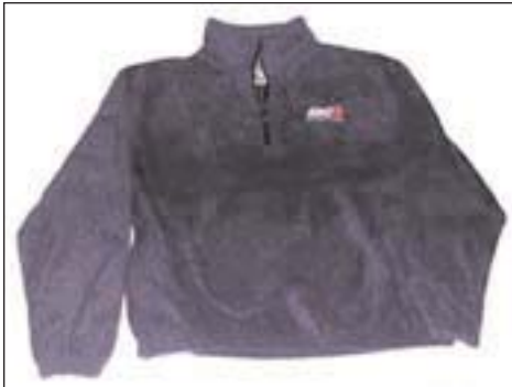
#9660 Navy Half Zip Polar Fleece Pull-Over