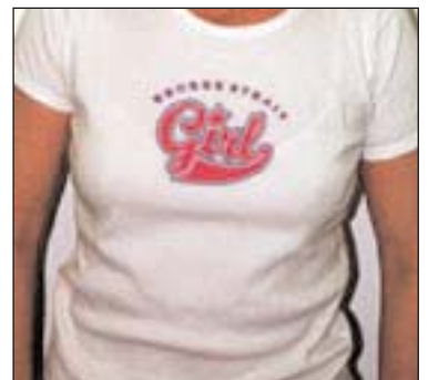
#4640 Ladies White Cap Sleeve