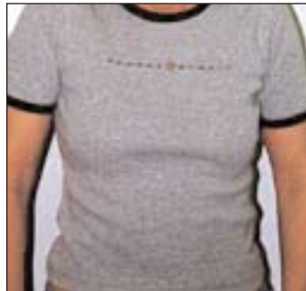
#4645 Ladies Ringer T-Shirt