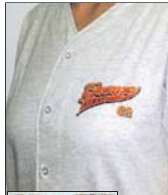
#5023 Sports Gray Baseball Jersey