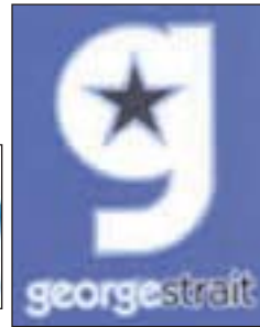
Logo on #4650