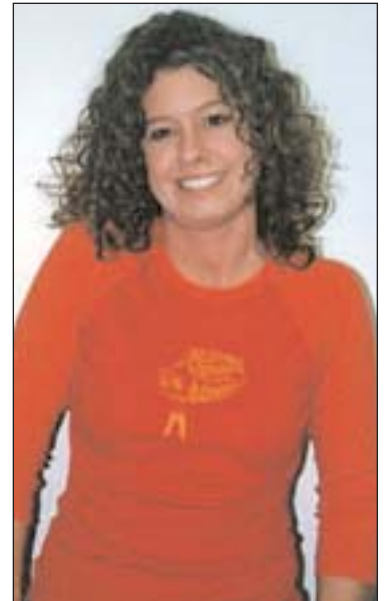
#4655 Red/Orange Ladies Baseball