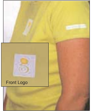
#4630 Kiwi Cap Sleeve