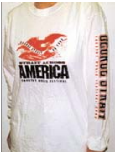
#5015 White Long Sleeve Shirt