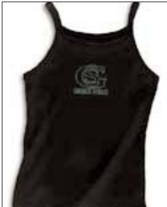
#4620 Ladies Black Spaghetti Tank Top