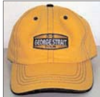
#4003 Mustard Cap