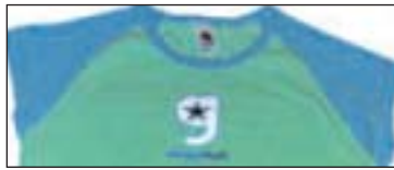
#4650 Ladies Green/Blue Cap Raglan Sleeve