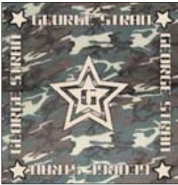
#4050 Camouflage Bandana