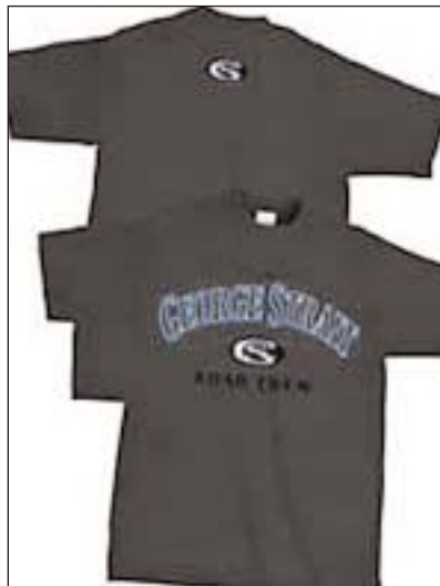
#5008 Road Crew T-Shirt