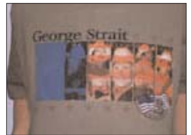
#5012 Prairie Dust T-Shirt