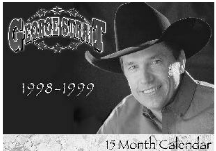
#638 - Calendar (12 page, 15 month - June 1998-August 1999)

FAN CLUB # - 1-615-824-7176 MONDAY - FRIDAY 9 A.M. - 5 P.M. ORDER DESK # - 1-800-338-4732 FAX # - 1-615-822-2527