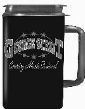
#1051 - Thermal Mug 32 oz. Black Mug w/New Country Music Festival design