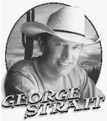
#5007 - White Tour T-Shirt